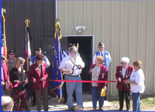
Beaver Creek Water Treatment Facility in Rifle

The Division of Local Government was created in 1966, as a recommendation of the Governor's Local Affairs Study Commission.